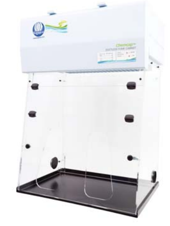
Model BC 8004