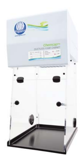
Model BC 4002