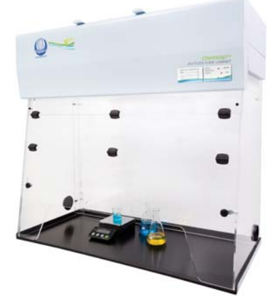
Model BC 1206