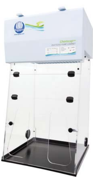
Model BC 6003