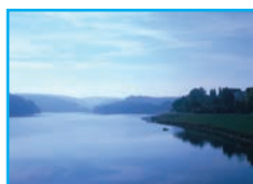
Lakes and rivers