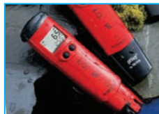
Floating waterproof case