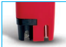
Exposed temp sensor for fast response time