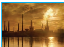
Test pH in boilers and cooling towers

Waterproof, accurate and portable, these handy little pocket meters are true 'go-anywhere' pH testers with replaceable electrodes.